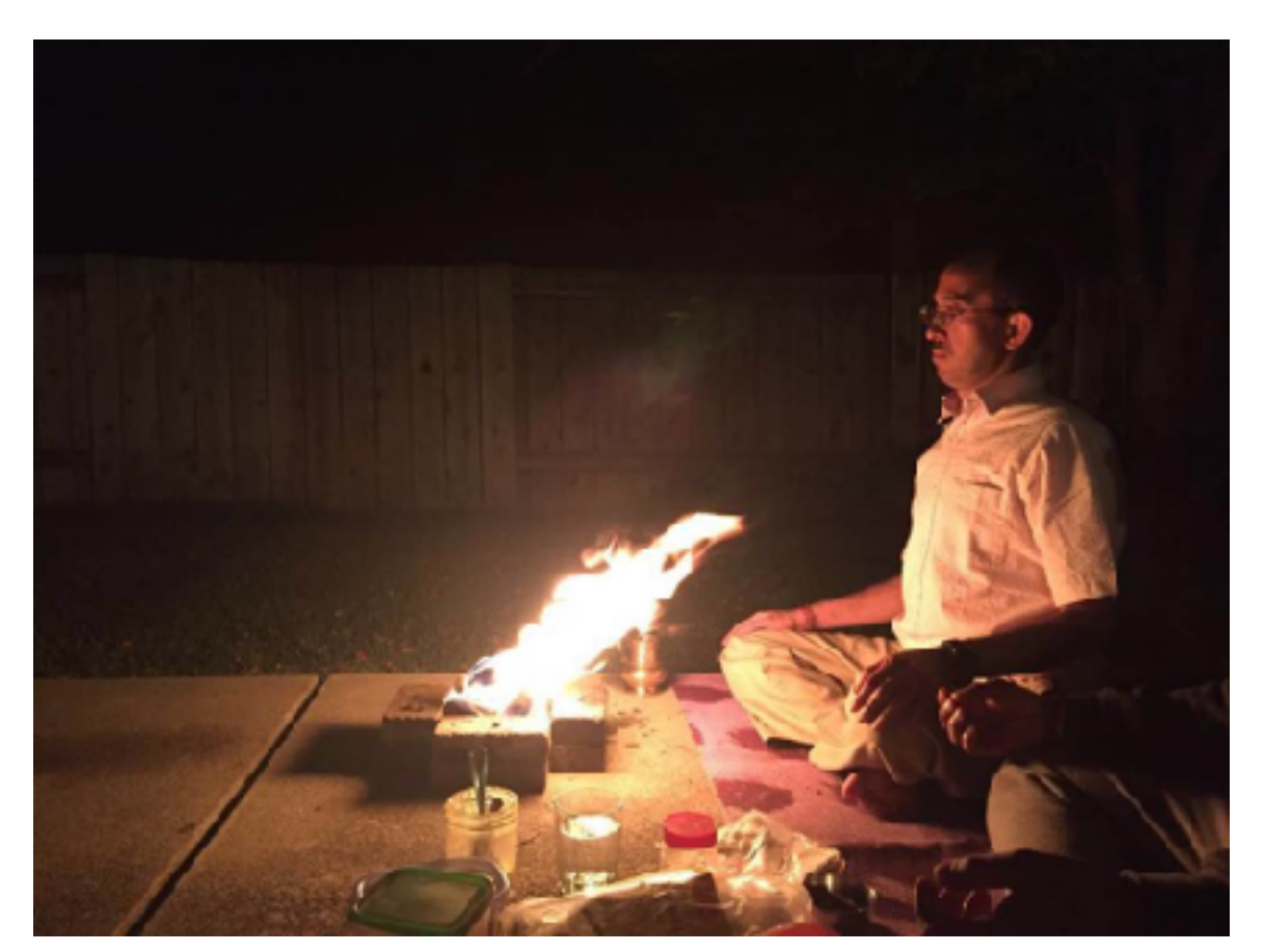
San Jose , 2016