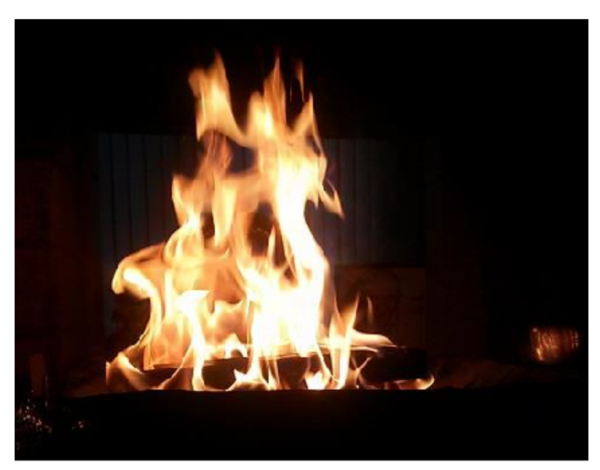
Daily homa , Boston USA, 2013