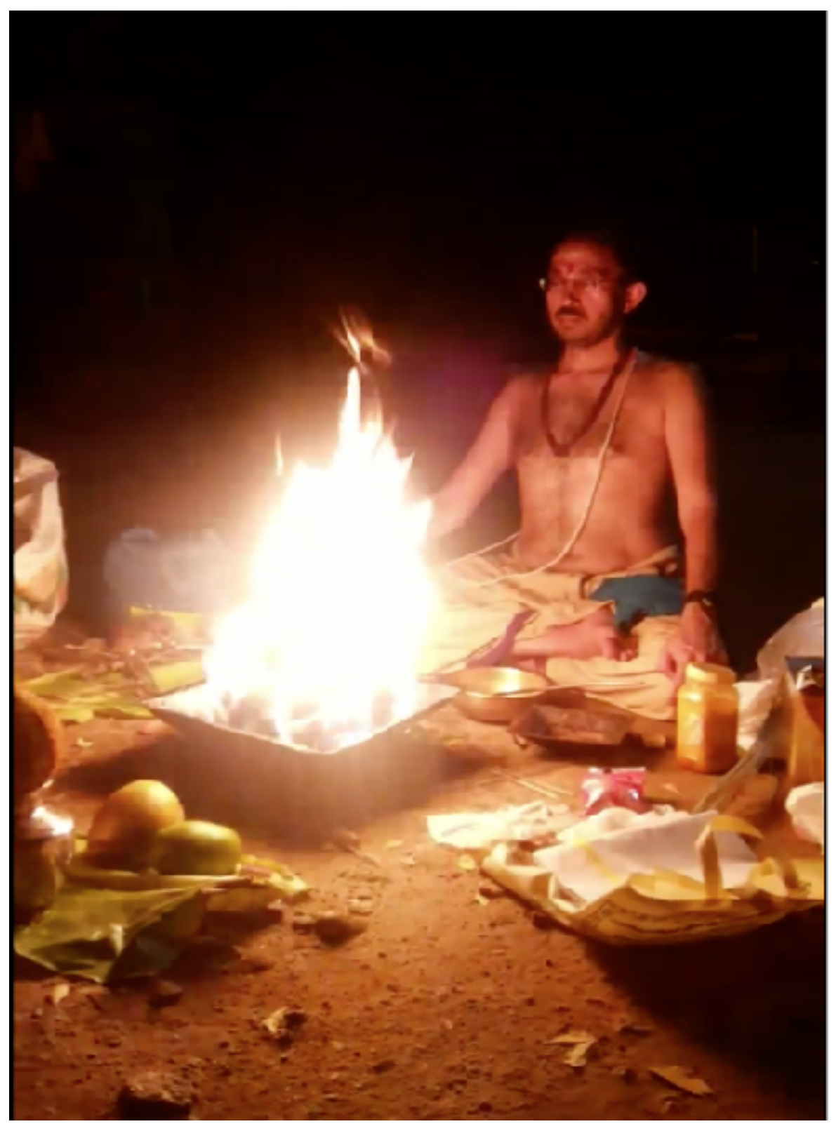
Arunachala , 2016